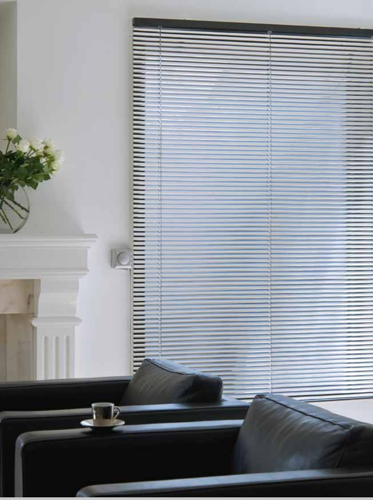
Venetian Blind System Silent Gliss 8110