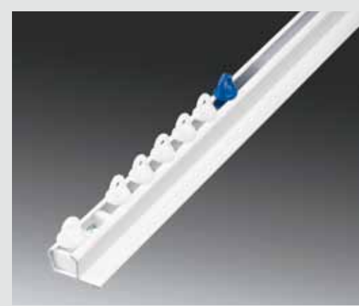
System 6290 – Ceiling Fix