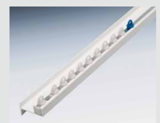
System 6021 – Wall Fix